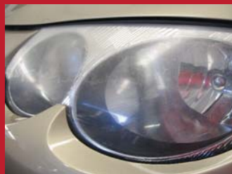
Before Fresh Start Detail

During the winter months, it's important to keep your headlights